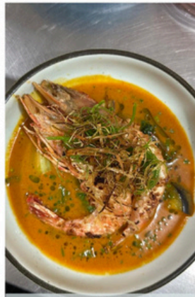
UDANG GALAH MASAK LEMAK