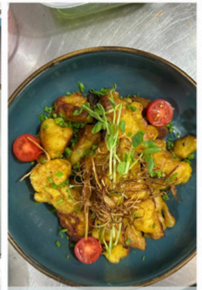
KEMBANG KOL BUMBU KUNING