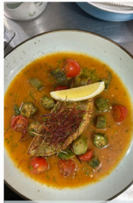
SNAPPER KUAH NYONYA