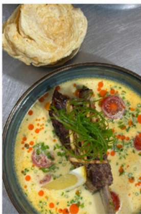
SOTO IGA SAPI BETAWI