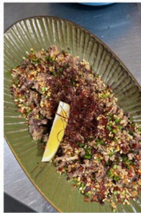
CUMI CABE GARAM