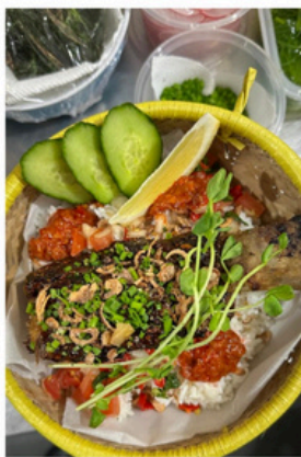
IGA BAKAR SEMAR