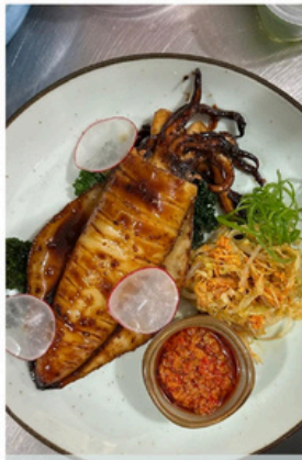
CUMI BAKAR MADU