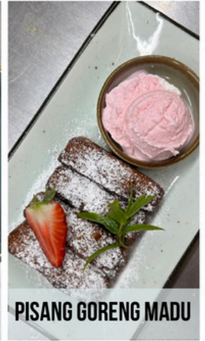
PISANG GORENG MADU