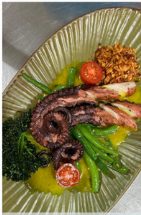
GURITA BAKAR PESMOL